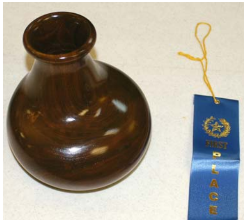
David Tucker's multi-axis vessel – 1 st place Advanced