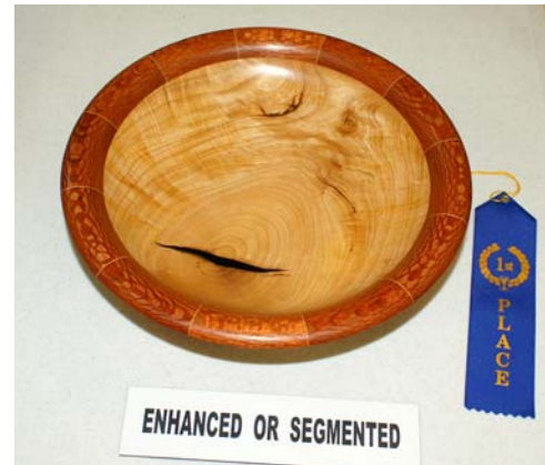
Bill Hubbard's segmented rimmed platter – 1 st place Enhanced/Segmented